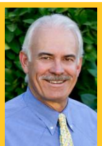
Bill Baffert (520) 975-2020 | bill@billbaffert.com