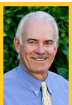
Bill Baffert (520) 975-2020 | bill@billbaffert.com