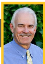
Bill Baffert (520) 975-2020 | bill@billbaffert.com