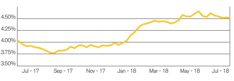
Freddie Mac's Mortgage Rate Trend predicts "Mortgage Rates Move Up to Highest Level in Seven Years." That was when rates were around 4.61 percent for a 30-year loan.