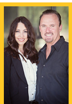
The Mitchell Team

Globally the luxury market continues to show high interest from many buyers in the USD $1 million or more class, quite simply because they can afford it. Worldwide, the reasons for buying are fairly consistent: Improve quality of life, financial investments, change of scenery, looking to downsize and looking to upsize. TAKEAWAY: Buyers see luxury real estate purchases as a reflection of their personal achievement.