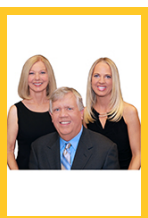
Patterson Team (480) 216-0460 | LJPKW@Cox.Net

Globally the luxury market continues to show high interest from many buyers in the USD $1 million or more class, quite simply because they can afford it. Worldwide, the reasons for buying are fairly consistent: Improve quality of life, financial investments, change of scenery, looking to downsize and looking to upsize. TAKEAWAY: Buyers see luxury real estate purchases as a reflection of their personal achievement.