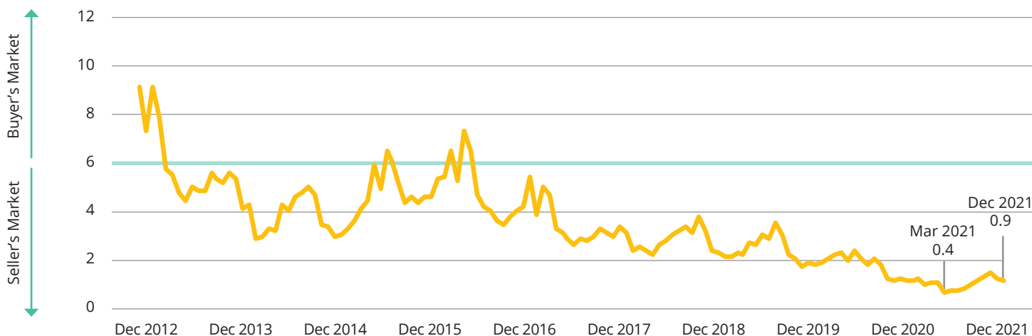
Months of Inventory — Tucson Metro

Months of Inventory reflects the relationship between closed sales and active listing inventory. Basically, it measures how long it would take to sell the current inventory at the current sales pace. 6.0 months is considered a balanced market, and less than 6.0 months is a seller's market. At one point in 2021 there was only two weeks of inventory, and the year ended with 0.9 months — a very strong seller's market.