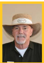
Steve J. Marino